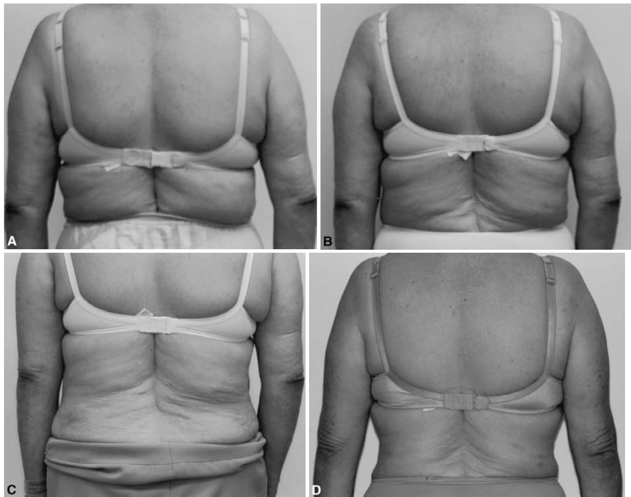
Fig. 2. A A 57-year-old patient with local fat deposit due to chronic cortisone use, before procedure. B. The 57-year-old patient after two applications of phosphatidylcholine (30 days). C. The 57-year-old patient after four applications of phosphatidylcholine (60 days). D. The 57-year-old patient after eight applications of phosphatidylcholine (120 days).